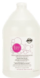
Bubble Juice (1 Gallon) SKU: BUB/G